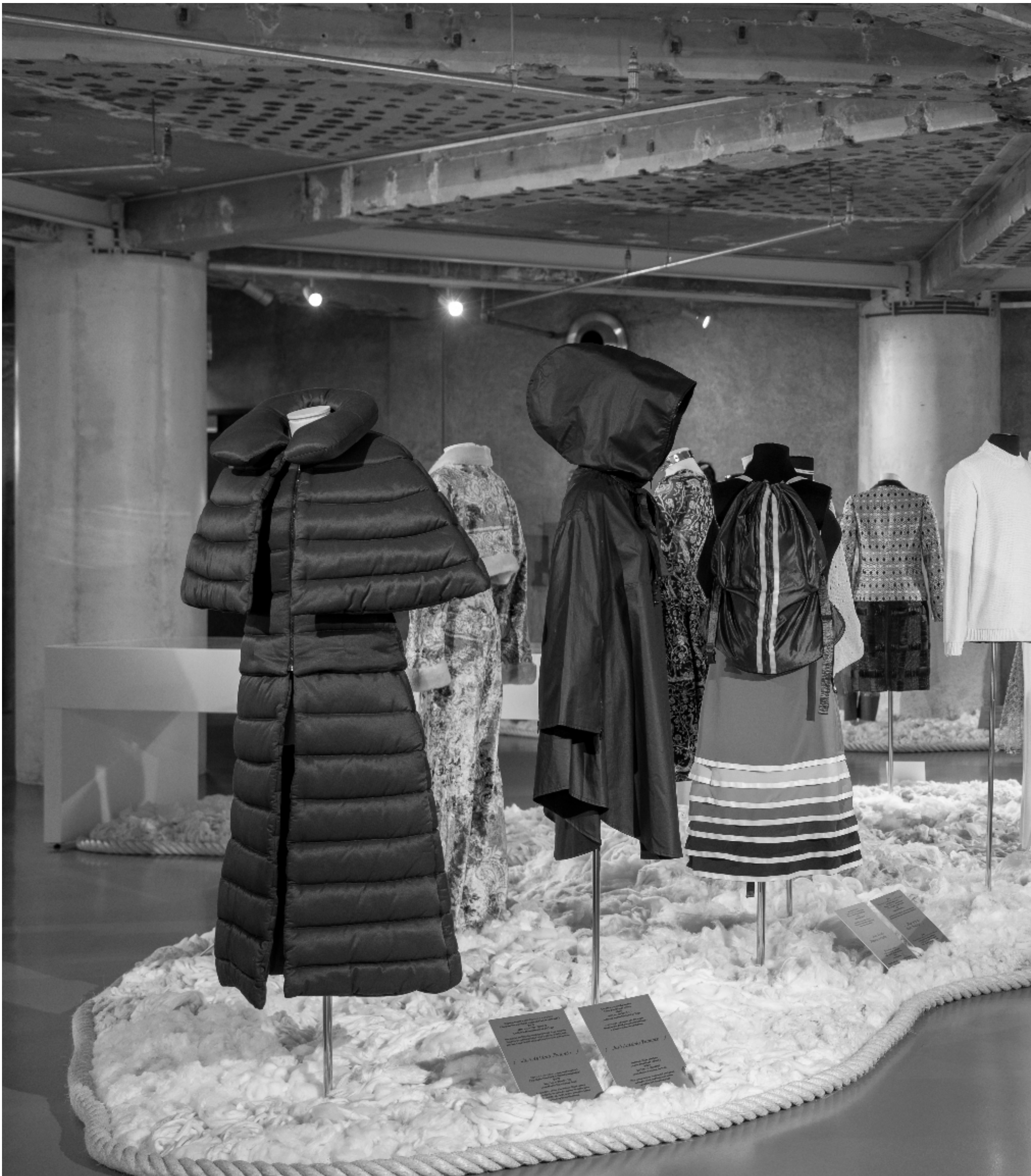
Eco-logical: The anthropology of places, matters and knowledge